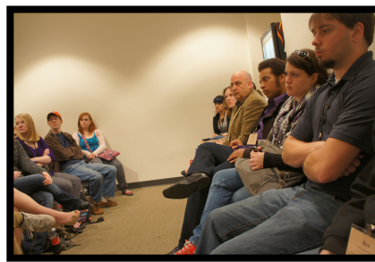
Figures 9 and 10: The full company of Splittin' the Raft conducts a post-show discussion.