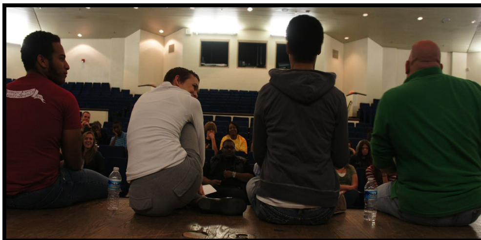
Figure 8: The cast of Splittin' the Raft hosts a post-show discussion with Newton County high school students.

It's one thing to perform controversial material within the cocoon of a campus black box theatre. People expect to find challenging art on a college campus. It's quite another to invade schools and communities where we would expose students and other unlikely theatregoers to socially critical work. The previous months had taught me to expect powder keg reactions. 25